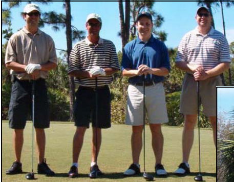
The REIS golf tournament was an 18-hole scramble format. The team

REIS members and guests gathered just for the fun of it at the annual social event, which was expanded this year to include a golf tournament. The festive event took place at Pelican Preserve on October 13.