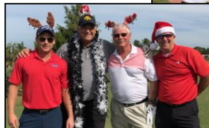
Golfers donned their gay apparel for the festive holiday tournament.